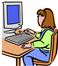
Studying online for the SAT

It is very important to prepare for the SAT and to stay on top of the SAT registration process. The Franklin High