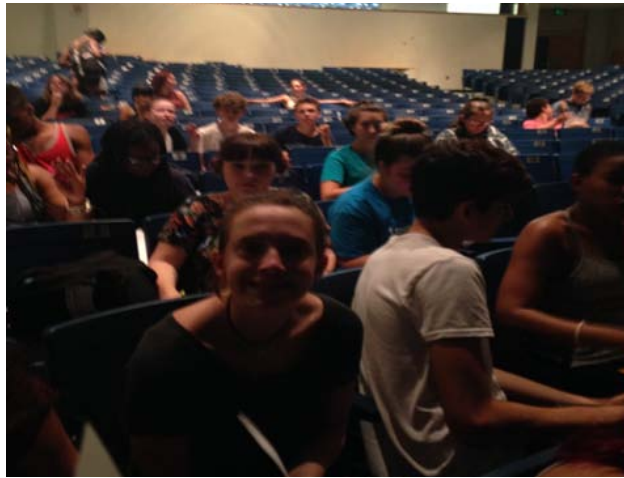
Students preparing for the coming auditions in the auditorium

such as previous engagements that might conflict with rehearsal. After the students turn the paper in they are given a number. While the students wait for their number to be called, they practice their monologue and worry. Each student is called in to perform and then wait some more. The final step of the audition process is callbacks. Callbacks are when the director wants to see more