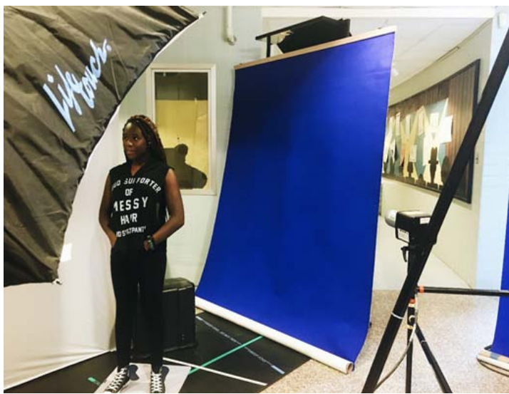
Student poses for her yearbook picture in the hallway of the auditorium while many other line up to wait their turn..

Picture day is stressful just in the thought that your teenage years will be permanently framed in a book owned by all your peers, but it can be overwhelming when those pictures are taken in an hot auditorium. Students worry about sweat stains and the practicality of their outfit in this environment. Students will try every hack and tip known to make their picture the least awkward it can possibly be and make this yearbook picture one that they'll want to remember.