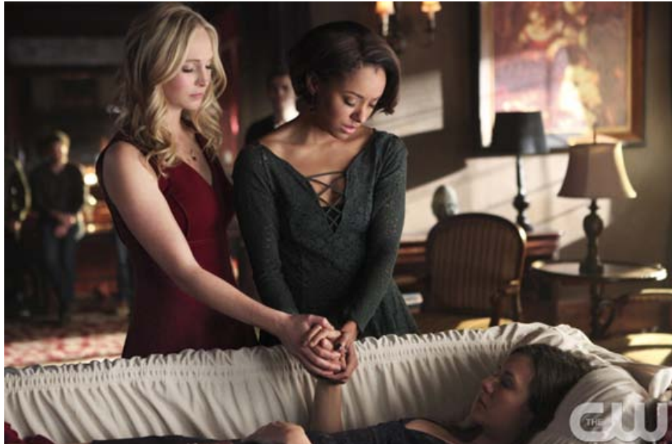
of Caroline (Candice King) and Bonnie (Kat Graham) saying their final goodbyes to Elena (Nina Dobrev).

Dobrev had always planned for Elena to have a six season run. When the time came, she and fellow cast mate, Michael Trevino left the show. Her character, Elena, had become a vampire in season three to prevent her death. Since then, a cure had been found for vampirism, and she became a human once again. Elena became mortal again, and planned on living a new life and finish-