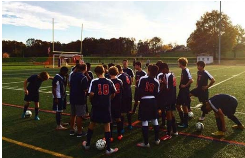
Franklin Boy's Soccer team before last year's playoff game. The new team is ready to put the past in the past.