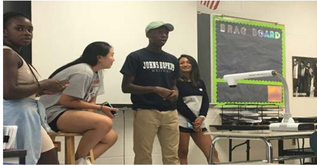
Student Government Association meet to discuss the goals of the upcoming school year and welcome new members.

The SGA would love to have more people join and be a