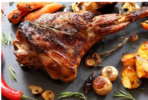
An Image of Cordero Asado, a common Spanish Christmas dish.

España - Cordero Asado: En España, les encanta comer cordero caliente y tierno en Navidad como uno de los platos principales. Es muy importante asegurarse de que el cordero está fresco y bien condimentado. En España, el cordero asado se prepara con vino, agua, laurel, limón, aceite y ajo. Cuanto más larga la carne sea marinada, mejor será su sabor.