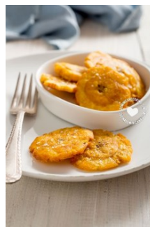
Image of Tostones, a dish from the Dominican Republic

La República Dominicana – Tostones: el nombre de este delicioso plato proviene de la palabra Tostón, que era el nombre de la moneda española utilizada durante el periodo colonial porque los tostones parecen pequeñas monedas de oro. Este sabroso plato consiste en rodajas de plátano frito doble que se han aplanado en círculos. Este plato tradicional sabe muy bien solo o con una salsa hecha de ajo llamada mojo .