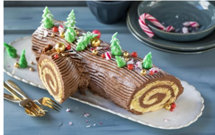
An Image of Bûche de Noël, a French Christmas Dish.

es un postre básico en la mesa de la cena en Francia. Está hecho con pastel de chocolate y glaseado, y decorado con hojas y frutas para parecerse a un tronco. ¡Qué delicioso!