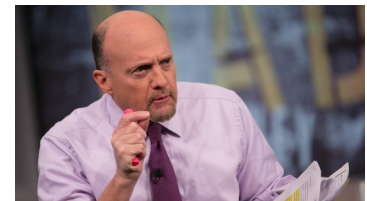
Image of Jim Cramer from cnbc.com

Not only does successful investing generate money, but it also helps people save. Instead of spending money on unnecessary things, investing in the stock market can "trick" investors into saving their money. Cramer notes, "Investing stocks can be a lot of fun, whereas leaving money in a savings account...feels really joyless for a lot of people."