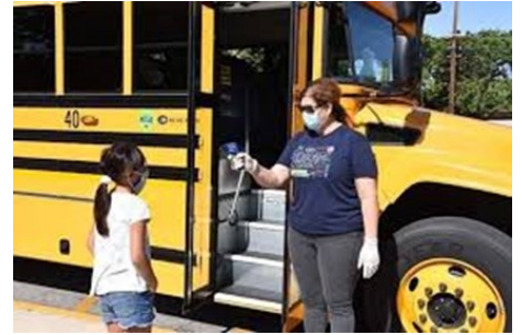
Bus driver and student wearing face coverings.

When in-person instruction resumes, safety drills will occur. Face coverings will be mandatory in order for students and staff to participate in in-school learning. Outside