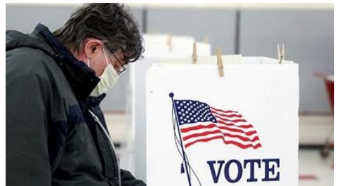
Voting in person looks quite different in 2020.

Given the move to both a mix of in-person and mail-in voting, it is unclear when we will know the results of each contest. Regardless of the outcomes, those who cast their ballots will be reassured and comforted, knowing that they were a part of the democratic process.