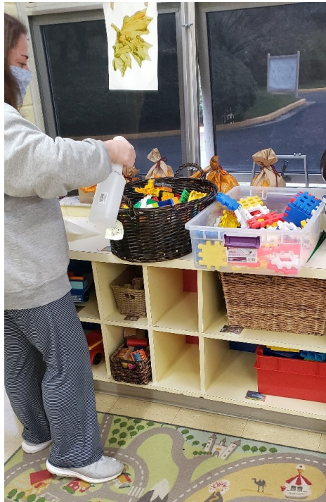
Three times a day, teachers clean items that students have touched.

"We can not have soft cloth things, such as baby dolls, pillows, and dress up clothes. Each child has to have their own supplies, no sharing. The kids are more spread out."