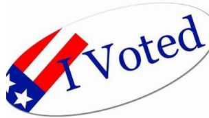
Turnout is expected to increase in the 2020 election.

If young people choose to participate, they will surely be represented in the final vote tallies. Eligible millennial and Generation Z voters could account for 37% of the 2020 electorate.