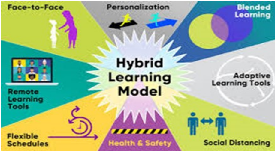
Different aspects of hybrid learning

BCPS reopening plan strives to achieve equity among students. The Board of education has stated that, “achieving equity means implicit biases and students’ identities will neither predict nor predetermine their success in school.” This means that all students will be treated fairly and impartially throughout distance and hybrid learning. BCPS will provide students with what they need in order to help them reach their full potential and prepare them for college and a future career. BCPS plans to provide services and supports to ESOL students, students with disabilities, students living in poverty, students who are homeless, and many more students of vari-