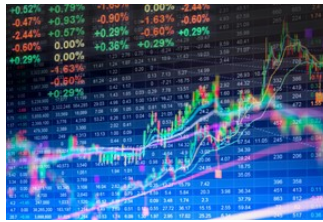
Percent returns of stocks

ter a stock market loss, the best way to recover is by investing again and waiting for the better investment. Not every stock will be at a low all at once, so watching the market and striking at the best moment is a waiting game. But not only is time beneficial for buying stocks at low prices, but for learning from mistakes. Relating to high school students, teachers always say mistakes are important for growth. Not only does this ideology apply to school, but to investing as well.