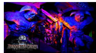
Bennett's Curse Valentine Fear

Now, let's not exclude the grownups out of this wonderful holiday! Visit the Truffle making for only $27 per person. Located in Robinson Nature Center at 6692 Cedar lane in Columbia. This activity starts February 16, and it's a great extension to the romantic idea of chocolates with truffle making!