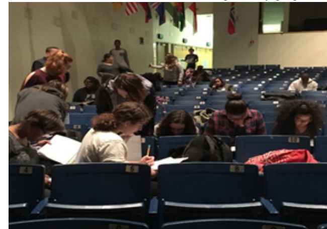
Students preparing last minute for auditions

There's no place like the home that is created by the Franklin theater program. This year the theater program decided on The Wizard of Oz as the spring musical. Parts of the school come to audition to be a part of the exiting adventure known as High School Theater. Anyone can audition if they want as long as they prepare the